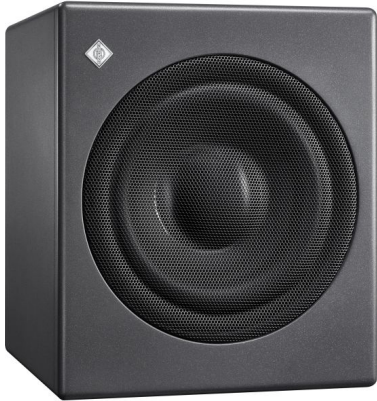
The KH 750 DSP is a particularly compact subwoofer for broadcast, music and post production studios